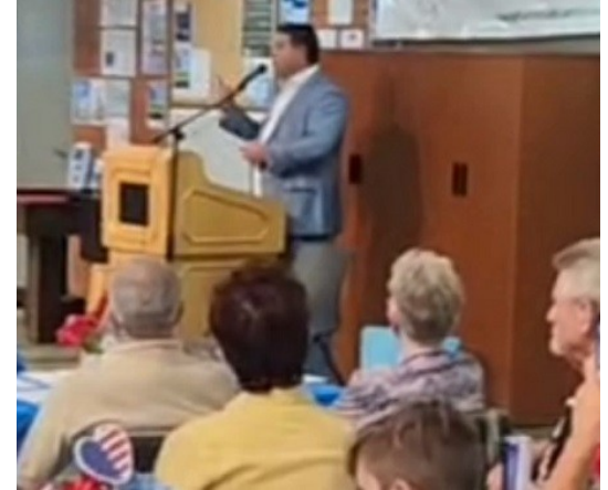
TCCR Staff Photos